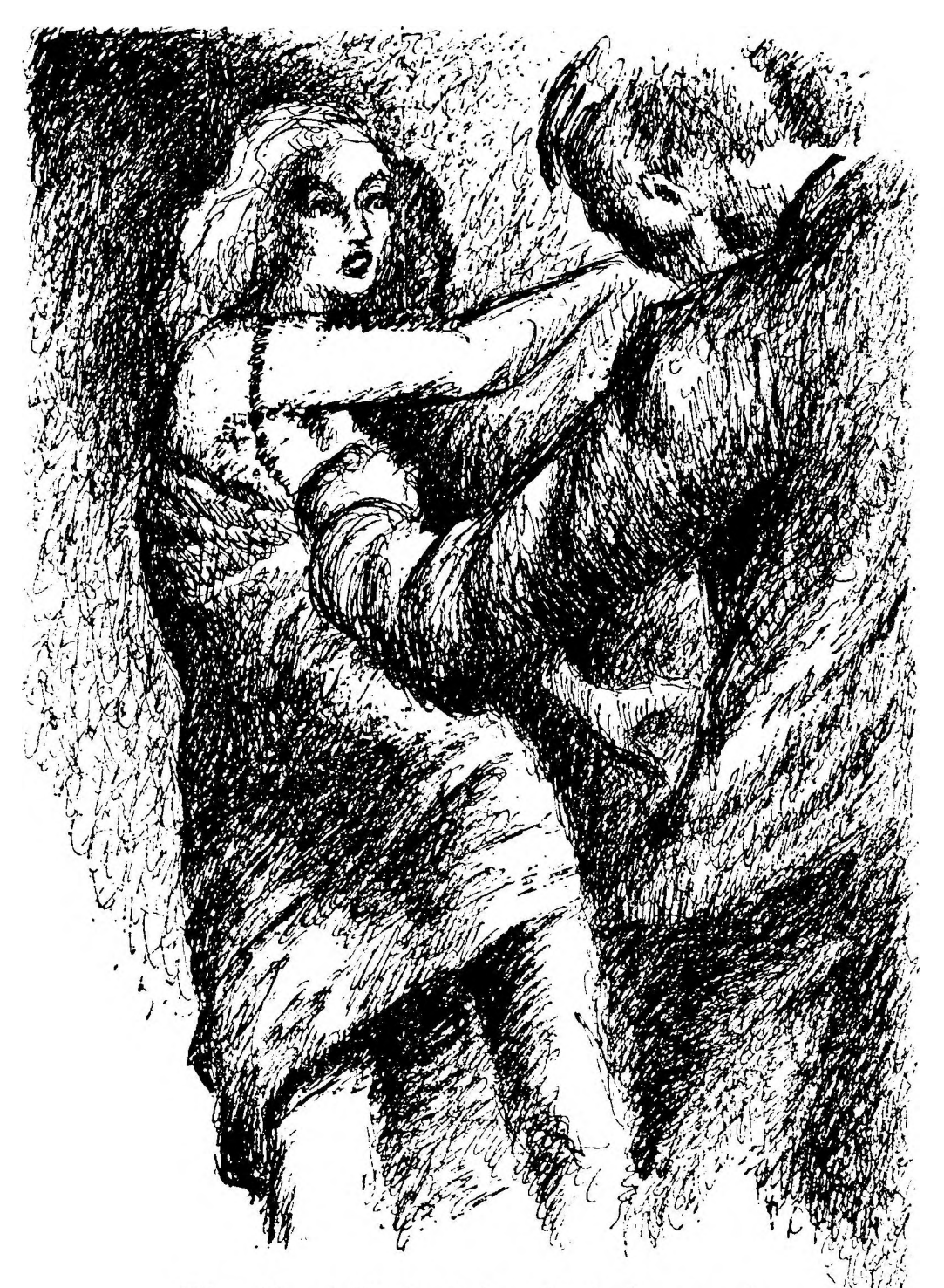
The old neighborhood brought back memories. And the memories were what Matt Cordell feared.